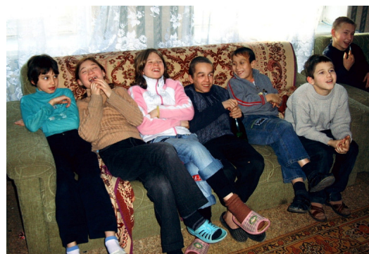
Teen-age kids in an orphanage where we went weekly.

Lord willing, we will return to Khabarovsk in August of '09. Our main goal is to work with older orphans as they graduate from orphanages. We feel the Lord has given us a four pronged plan to reach and assist young adult orphans. 1. Teach life skills to teenagers in the orphanages before they leave. 2. Establish a day center where they can come to find help and friendship. 3. Develop a mentoring-discipleship network to guide them in a deeper walk with