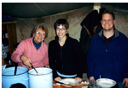
Short term workers serving at the homeless shelter in 2007.

The work with older orphans was challenging and needs more development, but we feel the first three goals were accomplished. We were able to purchase an apartment, Speed-The-Light bought a mini-van for our ministry, we've learned our way around the city, and have managed to settle in. Cecil at-